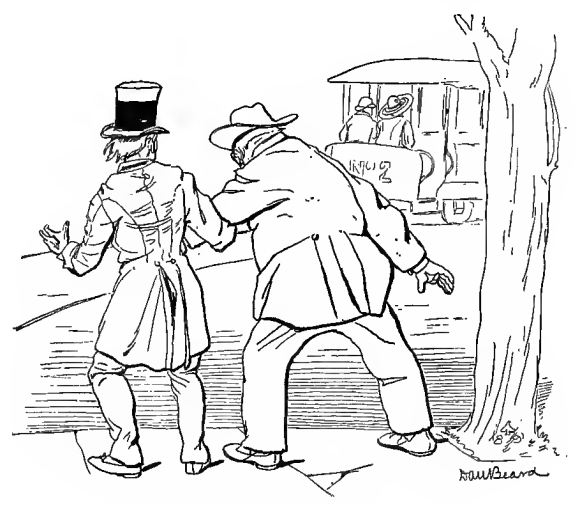
"BOTH WERE SO PARALYZED WITH JOY."

"Oh, very well," said Barrow, "the rest of the outfit is well enough, and while it's not too conspicuous, it isn't quite like the clothes that anybody else wears. Suppress the hat. When you meet your man he'll recognize the rest of his suit. That's a mighty embarrassing hat, you know, in a centre of civilization like this.